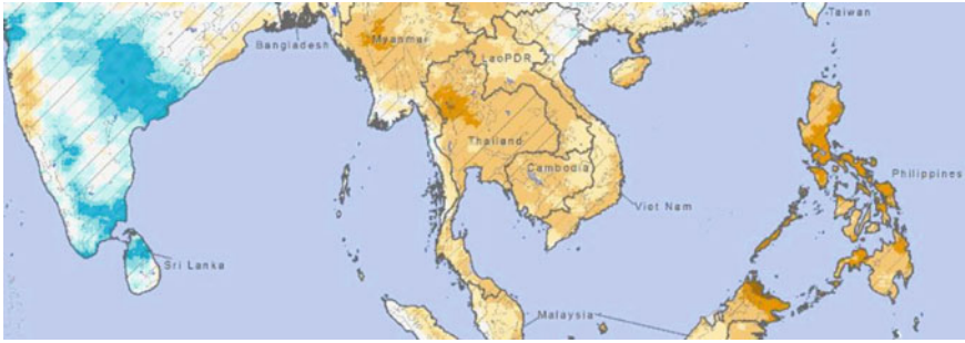
Fig. 9.1 Rainfall at end of June 2015: deficit ( brown ) and surplus ( blue ) (WFP 2015)

experiencing in recent years two extremes of water-related disasters, namely the 2011 floods and the ongoing drought started in 2014 that is causing severe water shortages issues across the country.